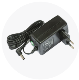
24V 1.2A Power adapter