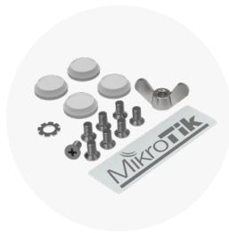
K-19 fastening set