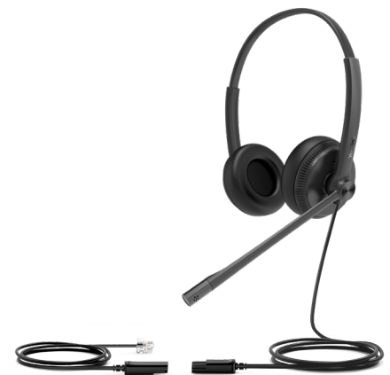
YHS34/YHS34 Lite Dual