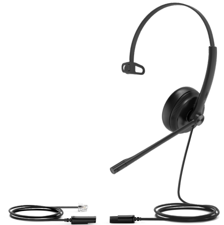
YHS34/YHS34 Lite Mono

Built for comfort with soft ear cushions and ultra-lightweight materials, the YHS34/YHS34 Lite is 10%~30% lighter than other headsets in the same range. Its ergonomic design makes this headset comfortable enough for long conference calls and all day use.