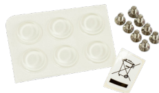
Screw and feet kit (K10)