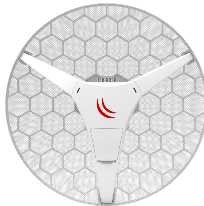
LHG HP5 / LHG 5 ac