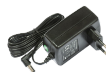
24 V 1.2 A power adapter included

IPsec hardware encryption (~470 Mbps) and The Dude server package are both supported, and the microSD slot provides improved read/write speed for file storage.