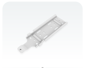
Outdoor case bracket