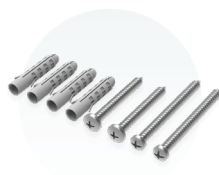
K-66 fastening set