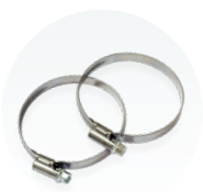
2x hose clamps