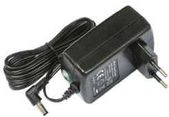
24 V 1.2 A power adapter