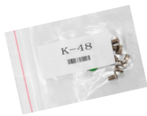
K-48 screw kit