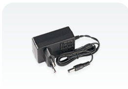
48 V 0.95 A power adapter