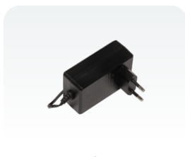
48 V 0.95 A power adapter