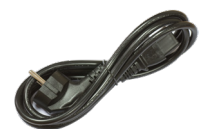
IEC cord (PoE version)