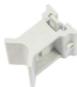
Pole mount bracket