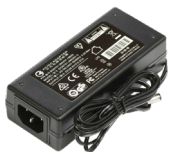
28 V 2.57 A power adapter (PoE version)