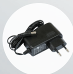
24V 0.8A Adapter