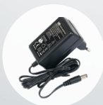
24V 2.5A Adapter