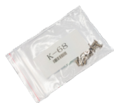
K-68 screw kit