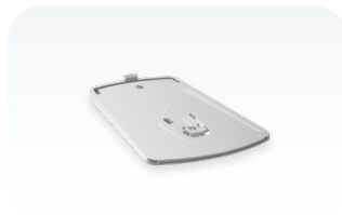
Base leg and pads