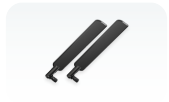
HGO indoor antenna kit