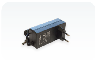
24 V 1.5 A power adapter