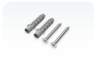
K-47 fastening set