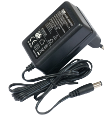
24 V 0.8 A power adapter