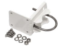
LHG precision mount